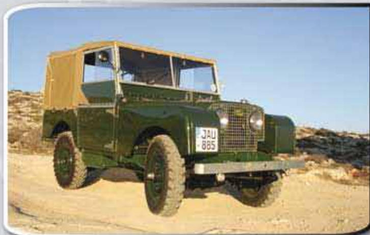
80" Full Hood