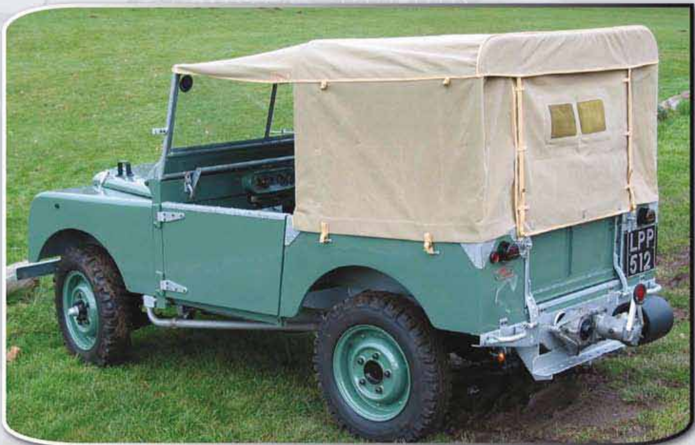
80" 7 Man Hood